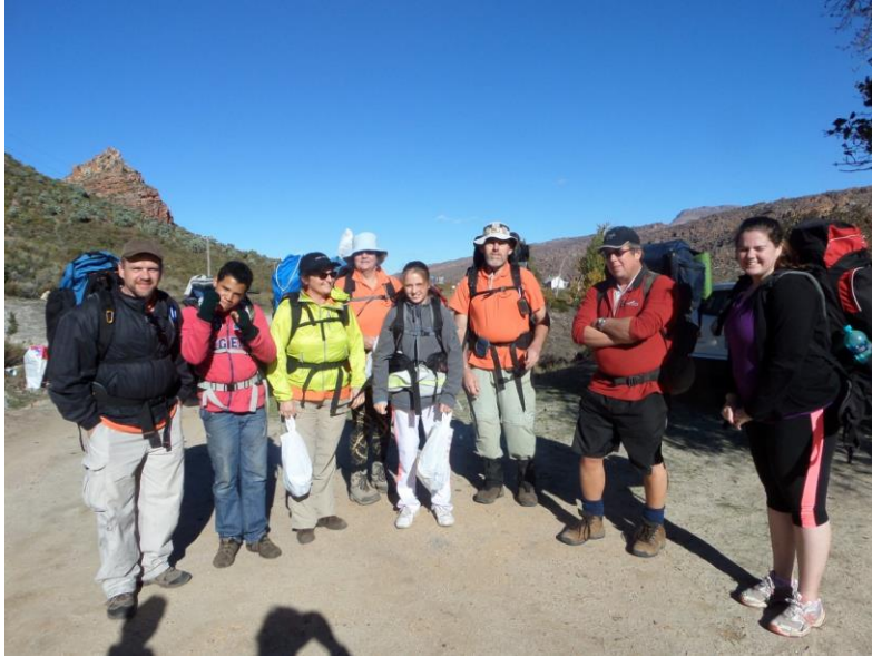
Team ready to leave for Boontjieskloof

We hiked from Grasvlei which is at an altitude of 830m for 4.5km to Boontjieskloof which is at an altitude of 1050m.