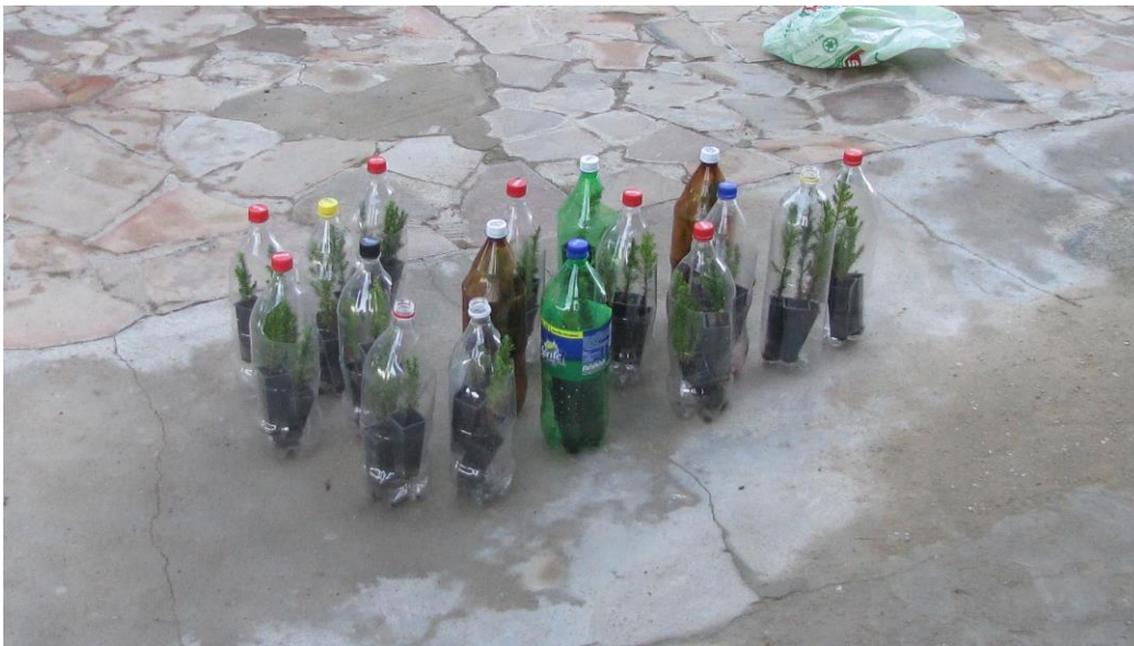
Small trees 3 to a bottle

The trees we got this year were very small trees called plugs. These small trees are a lot easier to carry when having to hike up into the mountains. We place 3 small plugs in a 2l cooldrink bottle to protect the young trees while being carried up the mountain. The small trees are also easier to plant closer to the rock in tiny crevices where larger trees cannot be planted.